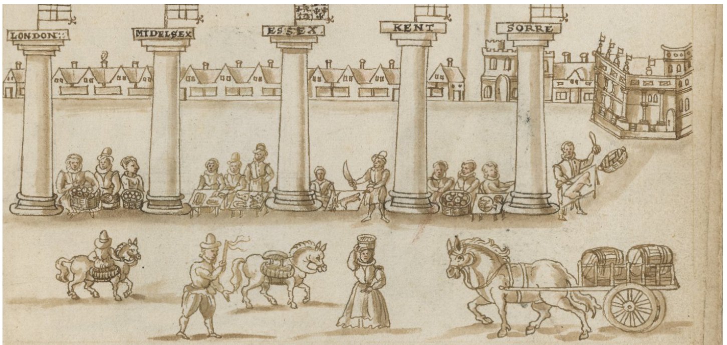
A market in London in 1598, with the names of the county sellers shown above their stalls. By permission of the Folger Shakespeare Library.

Silver Street: From about 1602, Shakespeare rented lodgings in the Silver Street house of the Mountjoys, a family of French immigrants who made expensive hats.